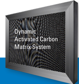
Dynamic Activated Carbon Matrix System