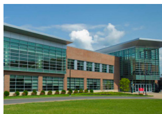
WPI Sports and Recreation Center Sustainable Design and LEED

relevant case studies that address a variety of challenges related to air quality, sustainability and maintenance, along with the solutions that provided proven results. These include: