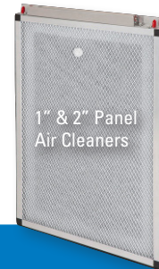
1" & 2" Panel Air Cleaners