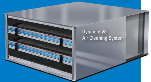
Dynamic V8 Air Cleaning System